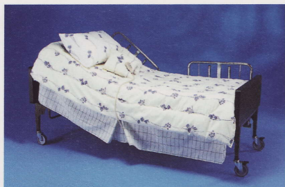
BAR600 with head raised.